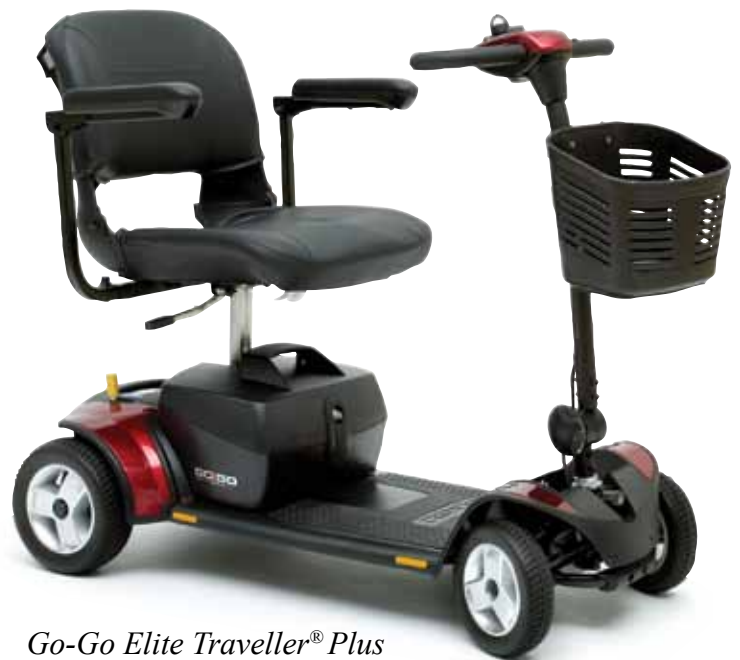
Go-Go Elite Traveller® Plus 4-wheel

The Go-Go Elite Traveller® Plus was designed to bring travel scooters to a greater range of people than ever before. An increase in length and width and a weight capacity of 325 lbs. combine with a wraparound delta tiller to allow both the larger individual and those with limited dexterity to experience the benefits of a travel specific mobility product for the first time. One hand feather-touch disassembly makes the Go-Go Elite Traveller Plus the easiest travel scooter to take along anywhere.