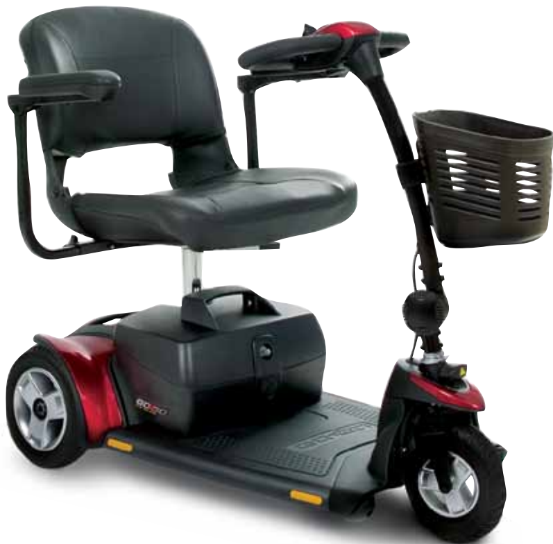
Go-Go Elite Traveller® Plus 3-wheel

The Go-Go Elite Traveller® Plus was designed to bring travel scooters to a greater range of people than ever before. An increase in length and width and a weight capacity of 325 lbs. combine with a wraparound delta tiller to allow both the larger individual and those with limited dexterity to experience the benefits of a travel specific mobility product for the first time. One hand feather-touch disassembly makes the Go-Go Elite Traveller Plus the easiest travel scooter to take along anywhere.