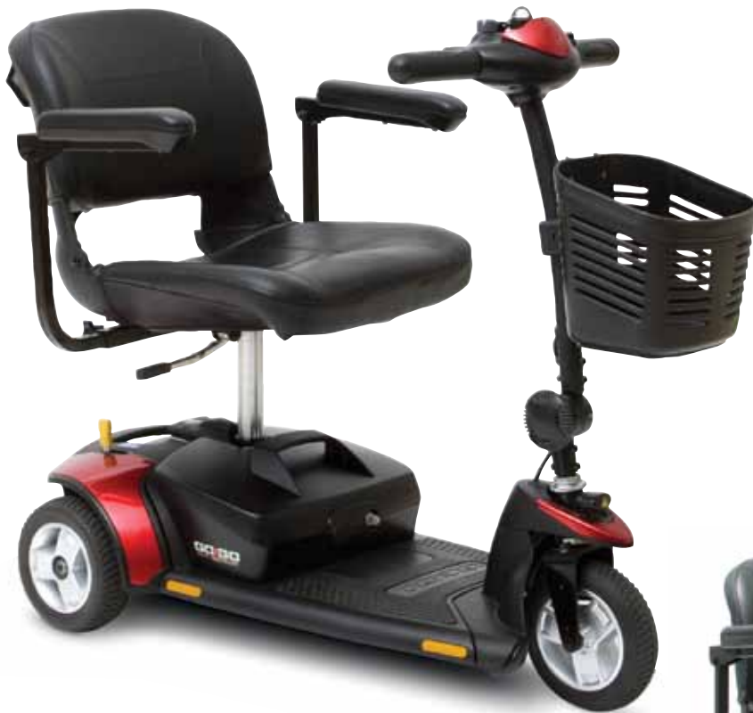
Go-Go Elite Traveller®, 3-Wheel

The Go-Go Elite Traveller®'s compact design allows it to easily maneuver in tight spaces while providing stable outdoor performance. Take the guesswork out of travel with simple, one-hand feather-touch disassembly. Go where you want to go, easily, with the Go-Go Elite Traveller.