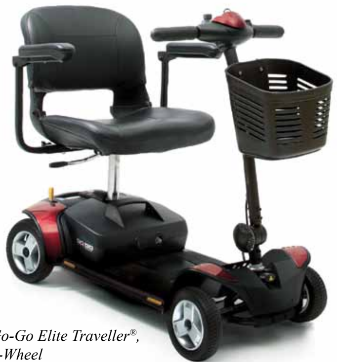
Go-Go Elite Traveller®, 4-Wheel

Pride Mobility Products Corp. — LIVE YOUR BEST —