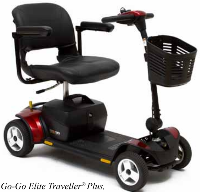
Go-Go Elite Traveller® Plus, 4-Wheel

The Go-Go Elite Traveller® Plus was designed to bring travel scooters to a greater range of people than ever before. An increase in length and width, and a weight capacity of 300 lbs. (325 lbs. w/HD version) combine with wraparound delta tiller to allow both the larger individual and those with limited dexterity to experience the benefits of a travel-specific mobility product for the first time. One hand feather-touch disassembly makes the Go-Go Elite Traveller Plus the easiest travel scooter to take along anywhere.