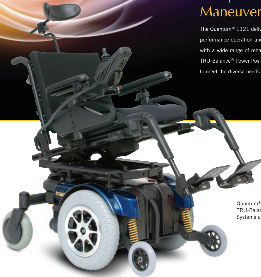
Quantum® 1121 shown with TRU-Balance® Power Positioning Systems and PG VSI controller

The Quantum® 1121 delivers exceptional maneuverability, high-performance operation and superb rehab capability. Compatible with a wide range of rehab electronics and seating options like TRU-Balance® Power Positioning Systems, the 1121 is designed to meet the diverse needs of the active rehab client.