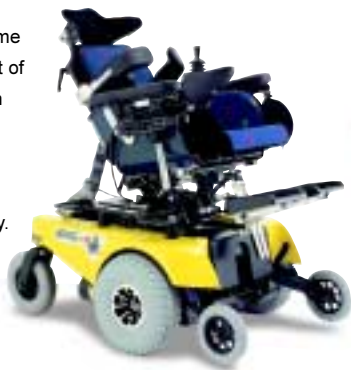
Quantum Dynamo ATS with Snug Seat Panda in Tilt/Recline Position

The Quantum Dynamo ATS offers all of the same features as the Dynamo, with the added benefit of Active-Trac ® Suspension, while maintaining an impressive 18" turning radius. Pride's Active-Trac ® Suspension allows active children the opportunity to negotiate the roughest terrain to effortlessly keep up with their friends and family.