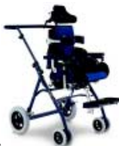
Tiger Folding Mobility Frame The frame folds for ease of storage and transport.