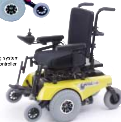
Quantum Dynamo ATS shown in Saber Yellow with Synergy ™ seating system and PG Remote Plus controller

For more information on the Quantum Dynamo and Dynamo ATS, call your QUANTUM SPECIALIST toll-free, 1-866-800-2002.