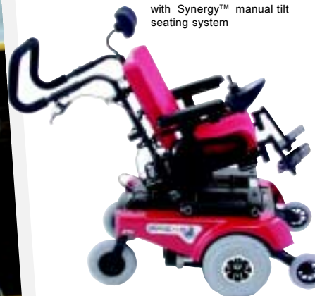
Quantum Dynamo ATS shown in T-Rex Red with Synergy ™ manual tilt seating system

Quantum Rehab is devoted solely to customizing the Quantum Power Chair line with specialty seating systems, controllers and a variety of rehab accessories based on an individual's needs and preferences. Our goal is to see that no child's needs go unmet.