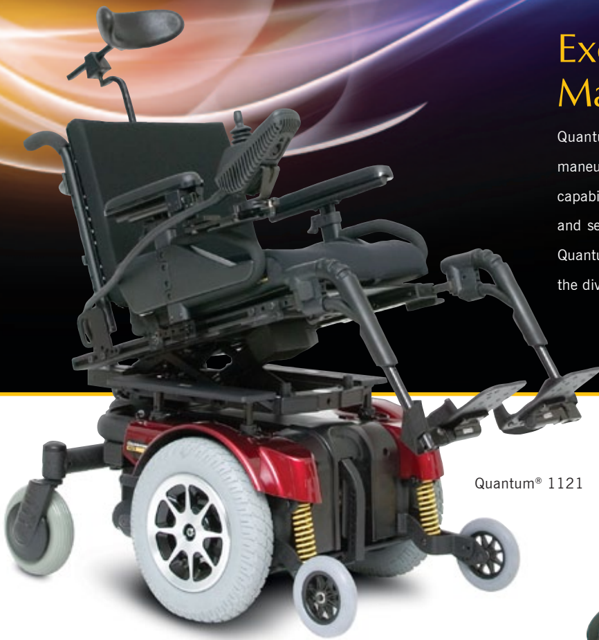
Quantum ® 1121

Quantum ® Mid-Wheel Drive Power Chairs deliver exceptional maneuverability, high-performance operation and superb rehab capability. Compatible with a wide range of rehab electronics and seating options like TRU-Balance ® Power Positioning systems, Quantum Mid-Wheel Drive Power Chairs are designed to meet the diverse needs of the active rehab client.