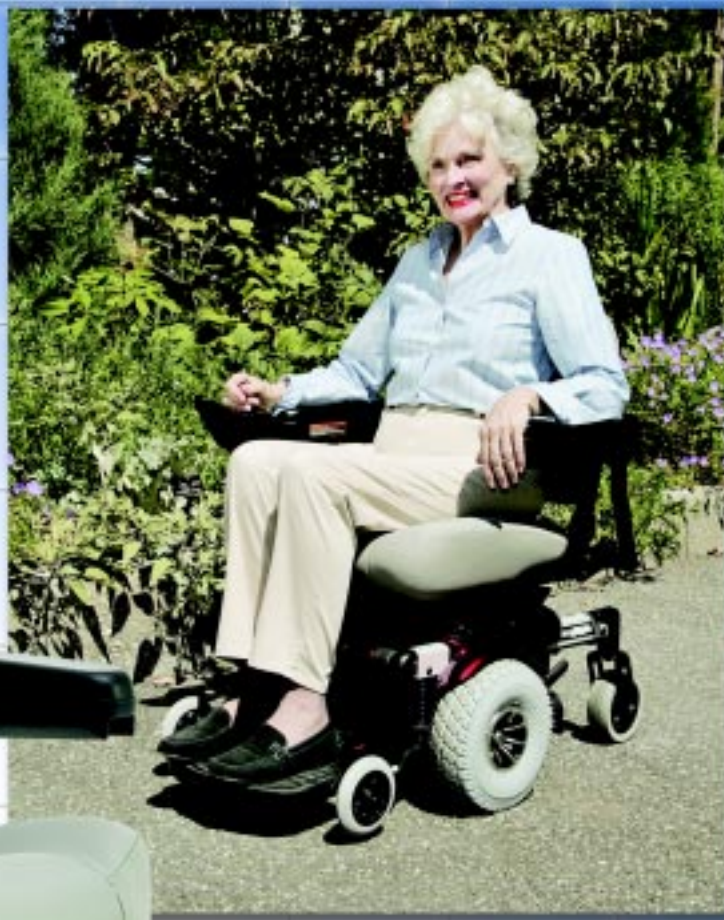
Jazzy ® 1107 Shown in Blue with medium-back seat, footboard and VSI controller