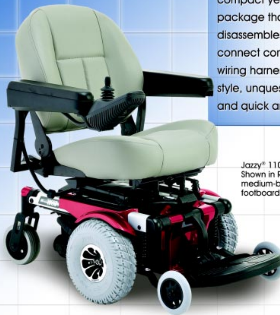
Jazzy ® 1107 Shown in Red with medium-back seat, footboard and VSI controller

More Advanced Features, Excellent Performance & Super Portability. The Jazzy ® 1107 brings the most advanced achievements of our engineering efforts together in one compact yet superbly balanced package that conveniently disassembles for transport. Direct connect components eliminate wiring harnesses and provide clean style, unquestionable convenience, and quick and easy disassembly.