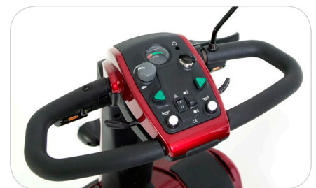
Easy-drive tiller with wraparound handles