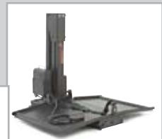
Backpacker ® Plus

These lifts are compatible with the Revo ® .