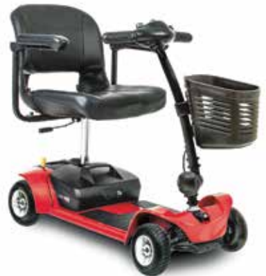
Go-Go ® Ultra X 4-wheel