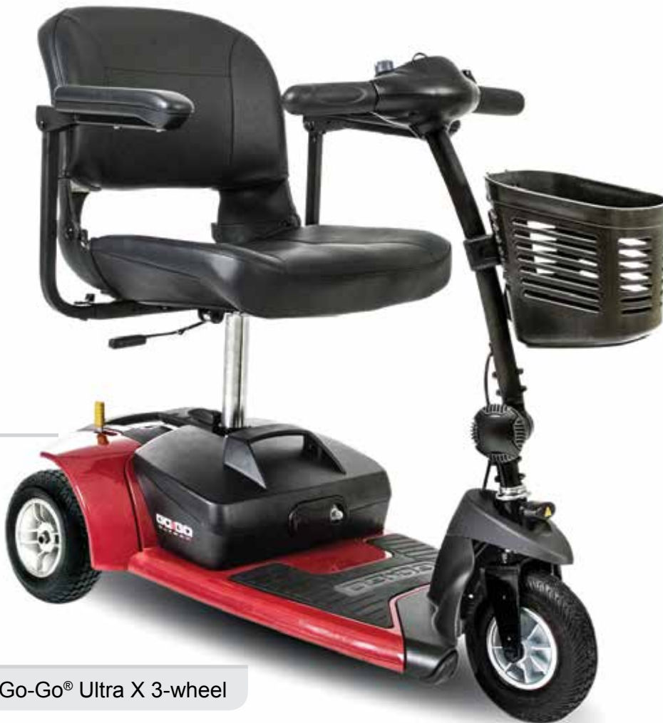
Go-Go ® Ultra X 3-wheel

The Go-Go ® Ultra X is loaded with features such as one-hand disassembly and a convenient drop-in battery box for worry-free travel. With a 260 lb. weight capacity, a maximum speed up to 4 mph, speeds up to 6.9 miles on the 3 wheel and 7.2 miles on the 4-wheel makes it an exceptional value.