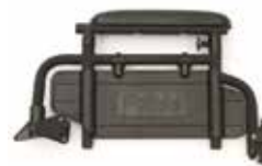
LTD Dual-post flip-back height adjustable arms