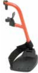
60°, 70°, 70° tapered, 80° and 90° aluminum bi-directional swing-away leg rests