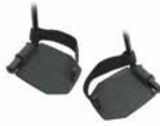
Flip-up aluminum footplates with heel loops