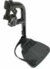
60° & 70° Hemi aluminum bi-directional swing-away leg rests