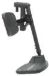
Elevating bi-directional leg rests with swing-away calf pads