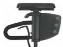
Height-adjustable drop-in armrests (desk or full length)

Beamsville, Ontario, 888-570-1113 quantumrehab.com