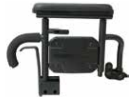
Height-adjustable, flip-back, dual post armrests (desk or full length)