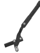
Push-to-lock with extension