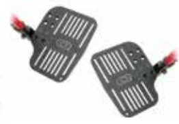
Angle-adjustable footplates in 5.5", 6.5" and 7.5" widths