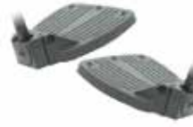
10-degree comfort adjust footplates in 4.25", 5" and 6" widths