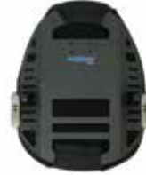
Synergy® SHAPE back