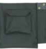
Standard nylon sling