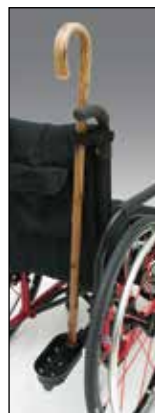
Combat, cane & crutch holder