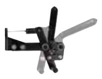
Cable-linked, unilateral wheel locks (for use with one-arm drive system)