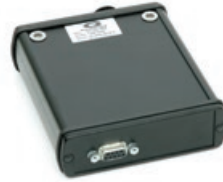
Environmental Control Unit (ECU)