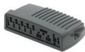
Advanced Actuator Module (AAM)