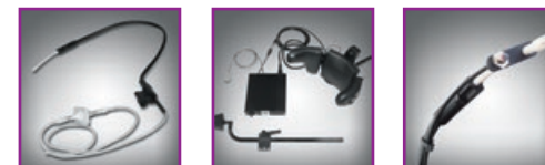
Therafin Whisper-Lite Sip-N-Puff Hardware ASL Sip-N-Puff Head Array Switch-It Sip-N-Puff with Opti-Stop