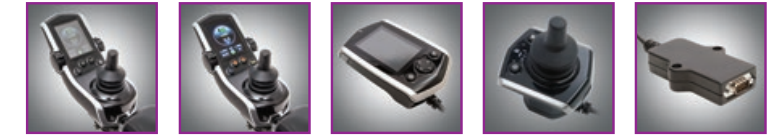
Q-Logic 2 EX Joystick Q-Logic 2 EX Joystick with Lights Q-Logic 2 EX Enhanced Display Q-Logic 2 EX Stand Alone Joystick / EX Attendant Joystick Q-Logic 2 Specialty Controls Interface Module