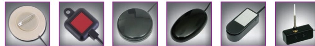
TASH Pillow Switch TASH Trigger Switch Buddy Button Egg Switch MicroLite Switch Switch-It Uniwobble Switch

* Either the Q-Logic 2 Enhanced Display or Q-Logic Enhanced Display is still required for Sip N' Puff and single switch driving.