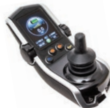
Q-Logic 2 EX Joystick for LED lights