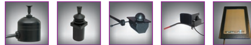
ASL Micro Extremity Control Switch-It Proportional Joystick Stealth Mushroom Joystick ASL Rim Control Switch-It Touch Drive