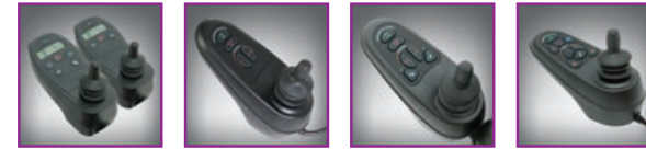
NE and NE+ PG VR2 (4-key) PG VR2 (6-key) PG VR2 (9-key)