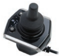
Q-Logic 2 EX Stand-Alone Joystick (SAJ) / EX Attendant Joystick