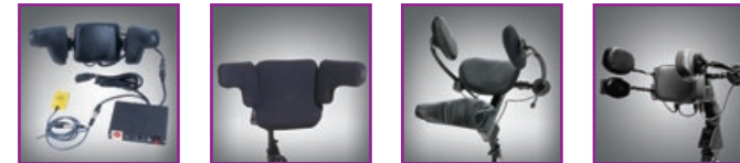
ASL 3-Switch Head Array Switch-It Head Array (3, 4 or 5 switch) 3-Switch Stealth Ultra Head Array Stealth i-Drive™ Tri-Array