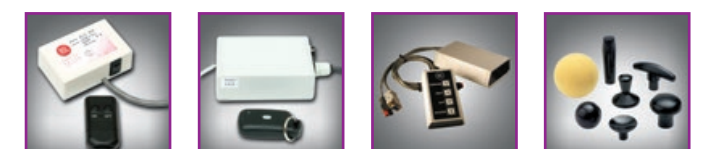
ASL Remote Stop Switch Switch-It Remote Stop Switch ASL Remote Attendant Control Joystick Handles