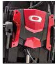
TRU-Balance® 3 color options