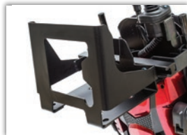
Trilogy Vent Tray MSRP: $420