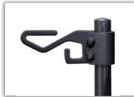
Personal Item Hook MSRP: $20