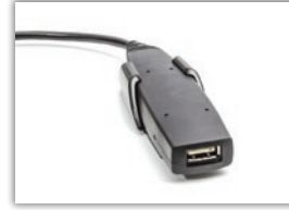
USB Mobile Device Charger MSRP: $185