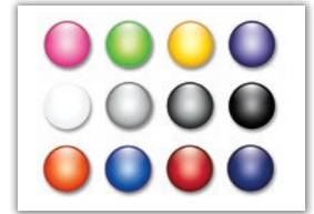
Coloured Edge Shroud