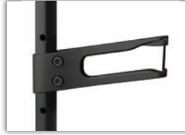
Backpack Holders (Pair) MSRP: $42