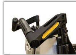
Push Handles (Pair) MSRP: $140