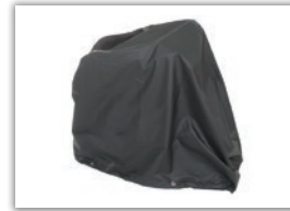
Weather Cover MSRP: $240