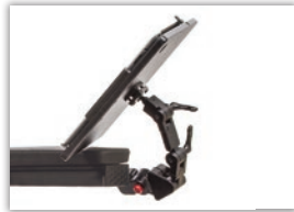
Tablet Holder MSRP: $565