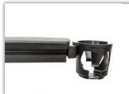
Cup Holder MSRP: $20

Not all items shown are available on all products. Please contact your authorized Quantum ® provider for details.