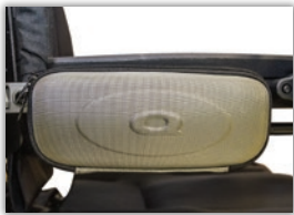
Glove Box MSRP: $85