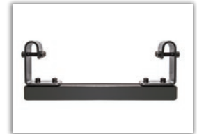
Rear Accessory Bar MSRP: $90