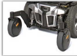
8" Caster Wheels (4) MSRP: $70