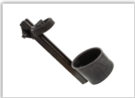
Oxygen Holder MSRP: $110