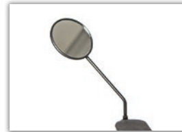
Rearview Mirror MSRP: $35