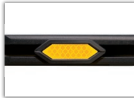
Reflector Kit MSRP: $35