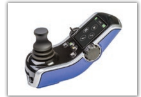
Joystick Shroud MSRP: $75