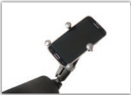
Phone Holder MSRP: $95