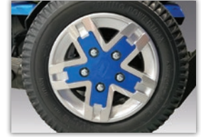
Wheel Accents MSRP: $85