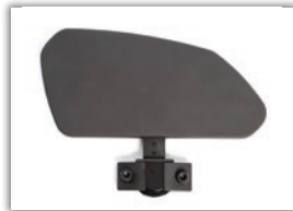
Clothing Guards (Pair) MSRP: $275