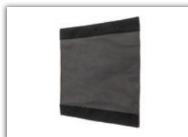
Privacy Flap (3 sizes) No charge on recline seating MSRP: $40