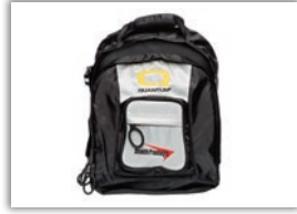
Quantum ® Backpack MSRP: $75