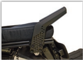
Transfer Bars (Pair) MSRP: $305