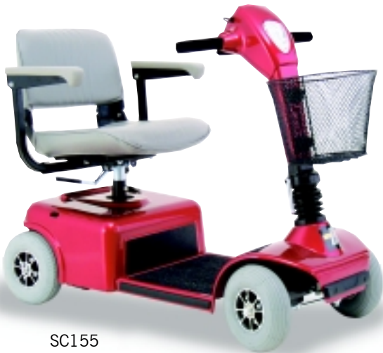
SC155 Rally® 4-wheel scooter shown in Candy Apple Red

The Rally® is sure to cause a stir with its futuristic styling, technologically advanced performance and overall great value—a combination irresistible and unmatched in the small scooter class. With the Rally, you'll stake your claim on a lifestyle of fun and freedom.