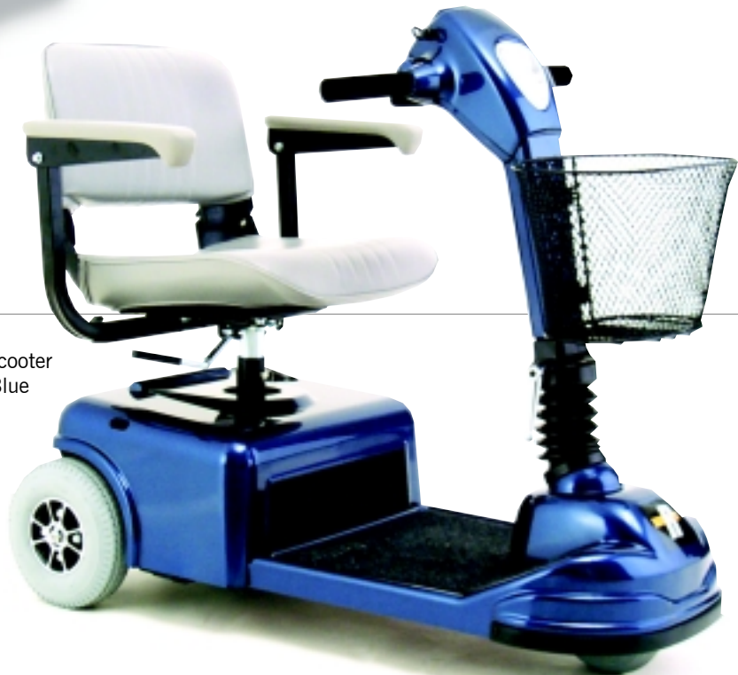
SC151 Rally® 3-wheel scooter shown in Viper Blue

Stylish Design & Premium Performance ...at an Excellent Value