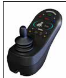
R-Net LED controller (standard)