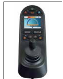
R-Net Colour LCD controller (optional)