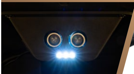
Backup sensor with LED lights