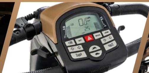
User friendly console