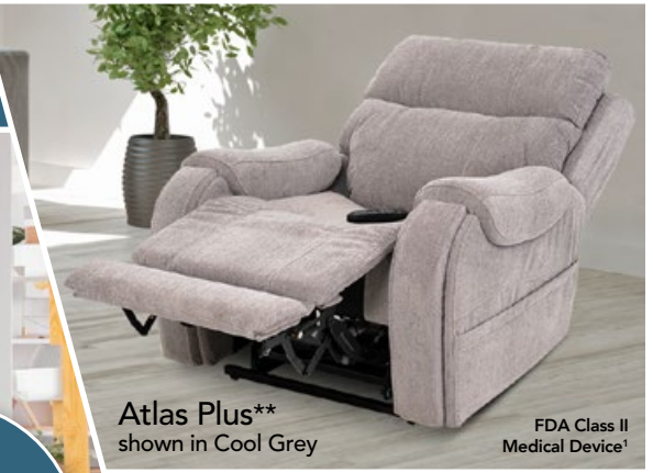
Atlas Plus** shown in Cool Grey