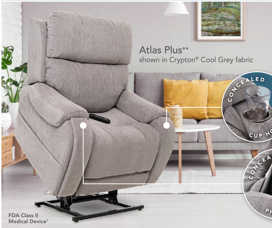
Atlas Plus** shown in Crypton® Cool Grey fabric