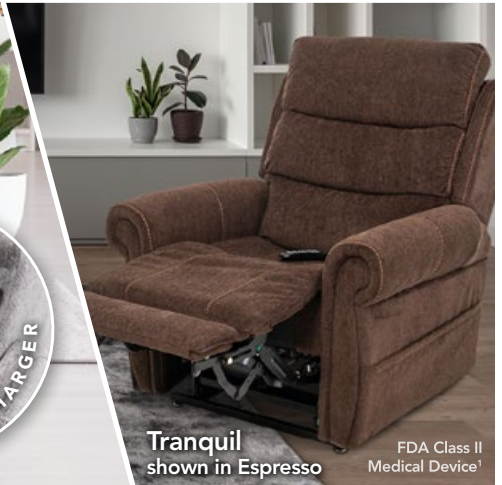
Tranquil shown in Espresso