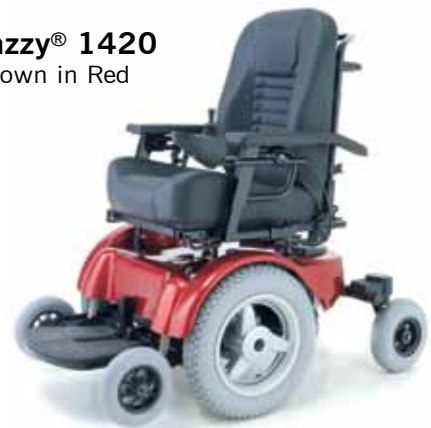
Jazzy® 1420 shown in Red