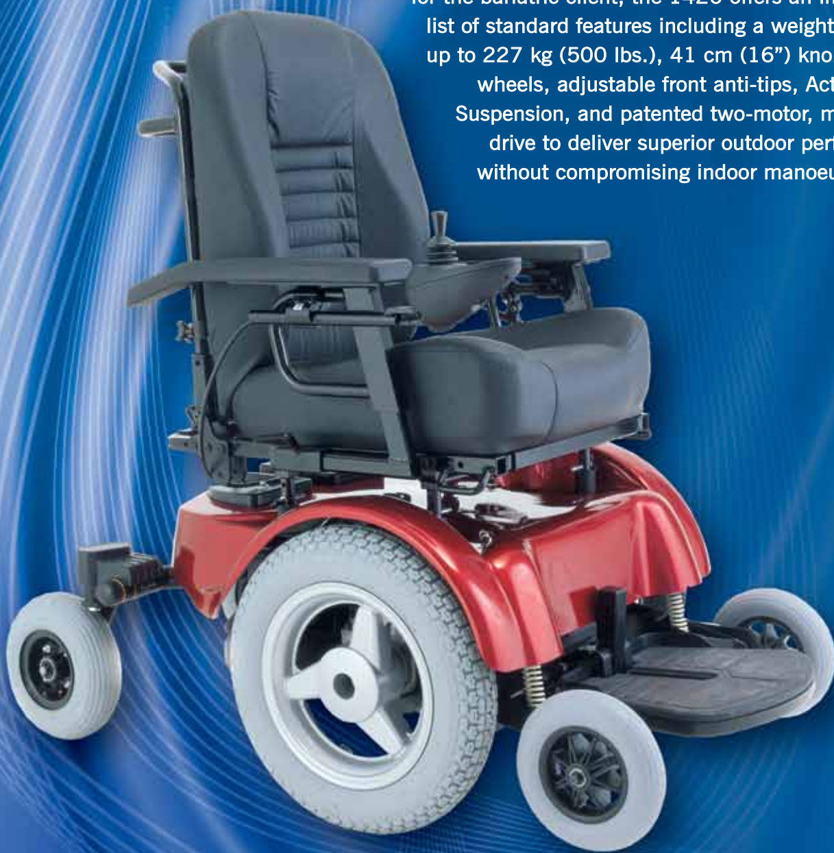
Jazzy® 1420 shown in Red

The Jazzy® 1420 offers a balance of performance, styling and tight manoeuvrability. Designed especially for the bariatric client, the 1420 offers an impressive list of standard features including a weight capacity up to 227 kg (500 lbs.), 41 cm (16") knobby drive wheels, adjustable front anti-tips, Active-Trac® Suspension, and patented two-motor, mid-wheel drive to deliver superior outdoor performance without compromising indoor manoeuvrability.