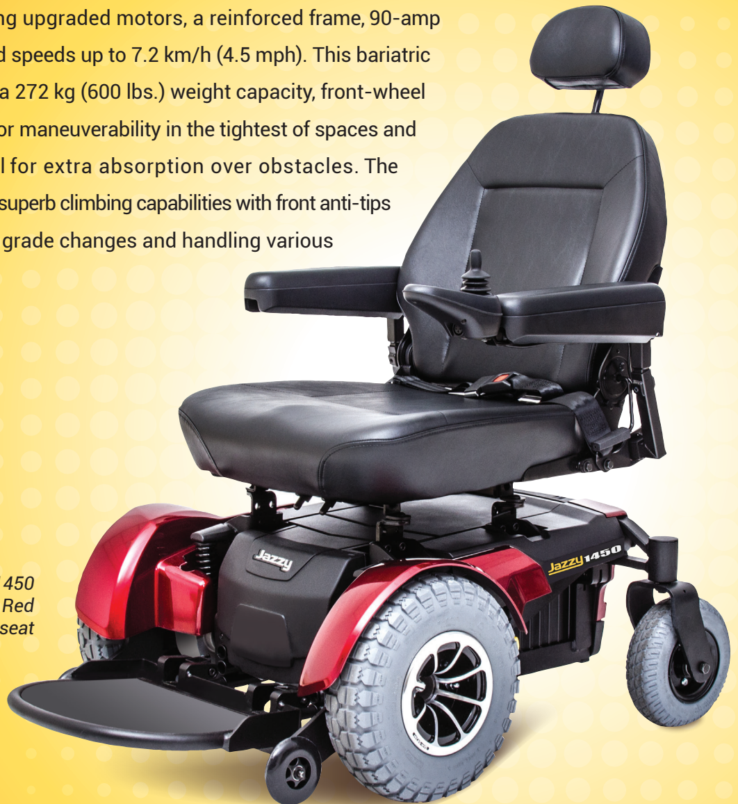
Jazzy® 1450 shown in Candy Apple Red with high-back seat

The Jazzy® 1450 offers heavy-duty construction and performance components including upgraded motors, a reinforced frame, 90-amp PG VR2 controller and speeds up to 7.2 km/h (4.5 mph). This bariatric power chair features a 272 kg (600 lbs.) weight capacity, front-wheel drive for superb indoor maneuverability in the tightest of spaces and large front drive wheel for extra absorption over obstacles. The Jazzy 1450 combines superb climbing capabilities with front anti-tips for transitioning over grade changes and handling various terrains easily.