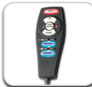
Heat and Massage