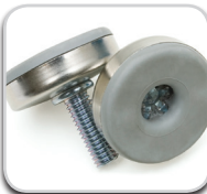
Non-Skid Leg Levelers