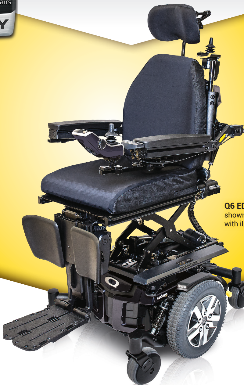
Q6 EDGE® Z shown in Back in Black with iLevel® technology