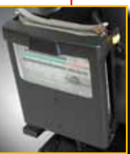
Compact Vent Tray

Please Note: Some options may not be available on all power bases. Please contact Quantum® Customer Service for availability.