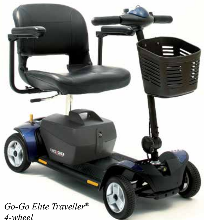
Go-Go Elite Traveller® 4-wheel