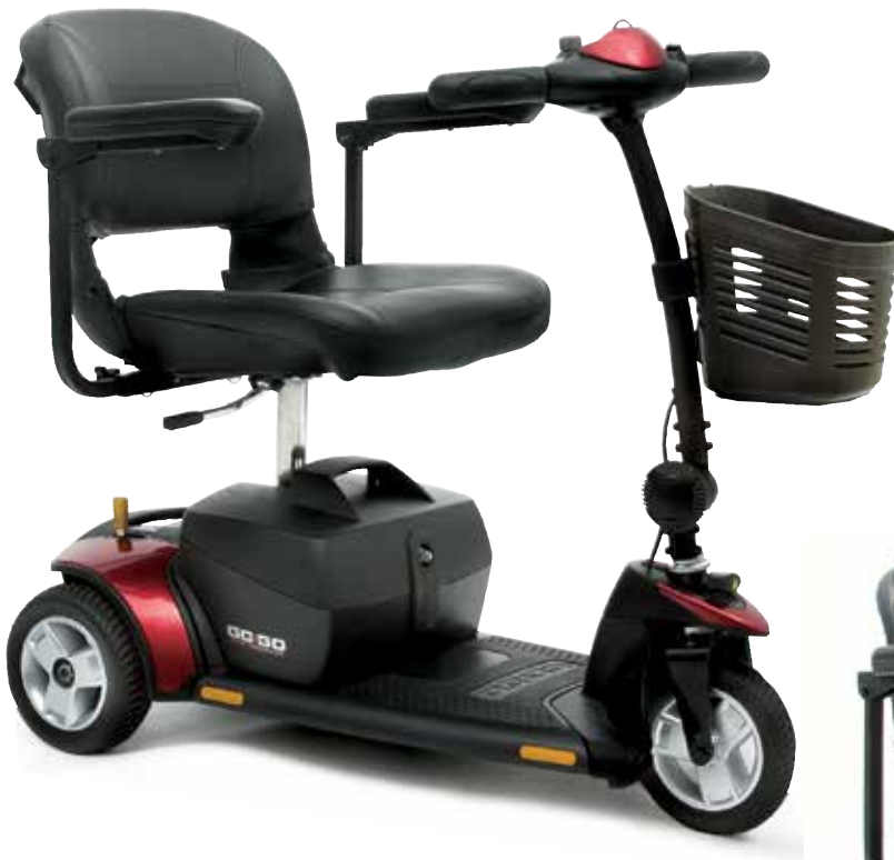
Go-Go Elite Traveller® 3-wheel

The Go-Go Elite Traveller®'s compact design allows it to easily maneuver in tight spaces while providing stable outdoor performance. Take the guesswork out of travel with simple, one hand feather-touch disassembly. Go where you want to go, easily, with the Go-Go Elite Traveller.