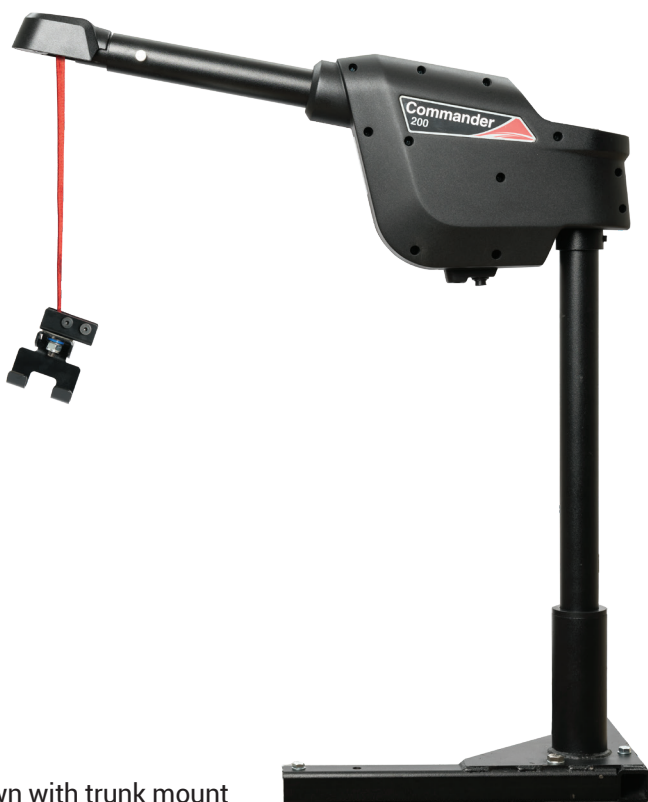
Shown with trunk mount