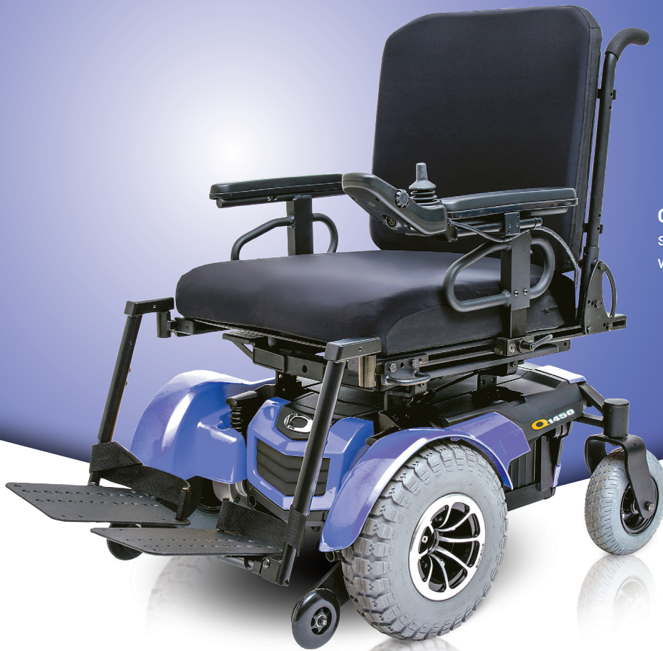
Q1450 shown in Sapphire Blue with Synergy® Seating