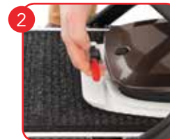
Pull Up Lever to Fold