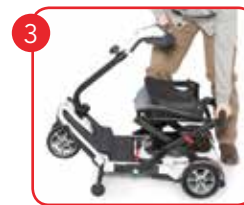
Fold and Lock Tiller