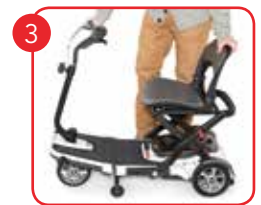
Unfold Seat; Lock in Place