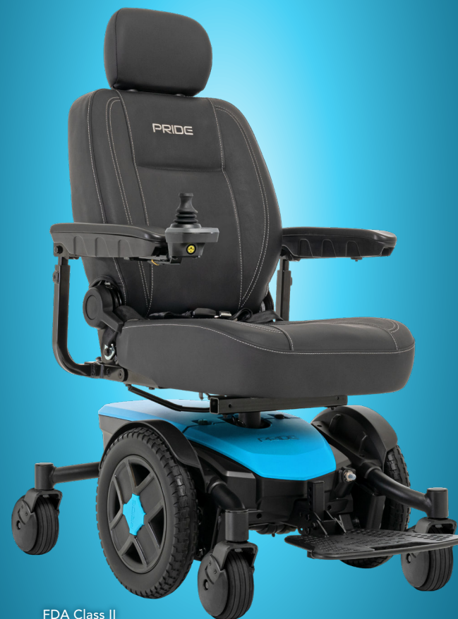
FDA Class II Medical Device 1

ALWAYS INSIST ON LITHIUM! pridemobility.com/Jazzy-Evo-613-Li