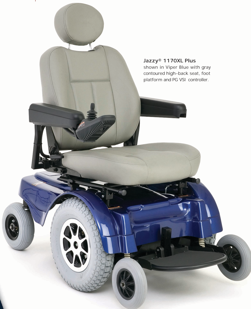
Jazzy® 1170XL Plus shown in Viper Blue with gray contoured high-back seat, foot platform and PG VSI controller.

The Jazzy® 1170XL Plus is a stylish, high performance power chair that combines excellent indoor maneuverability with a top speed up to 5 mph and a weight capacity of up to 500 lbs. It is equipped standard with Active-Trac® Suspension which provides for great outdoor performance and rough terrain handling. The Jazzy 1170XL Plus is the ultimate power chair for the active outdoor user who still requires tight-quarter indoor maneuverability.