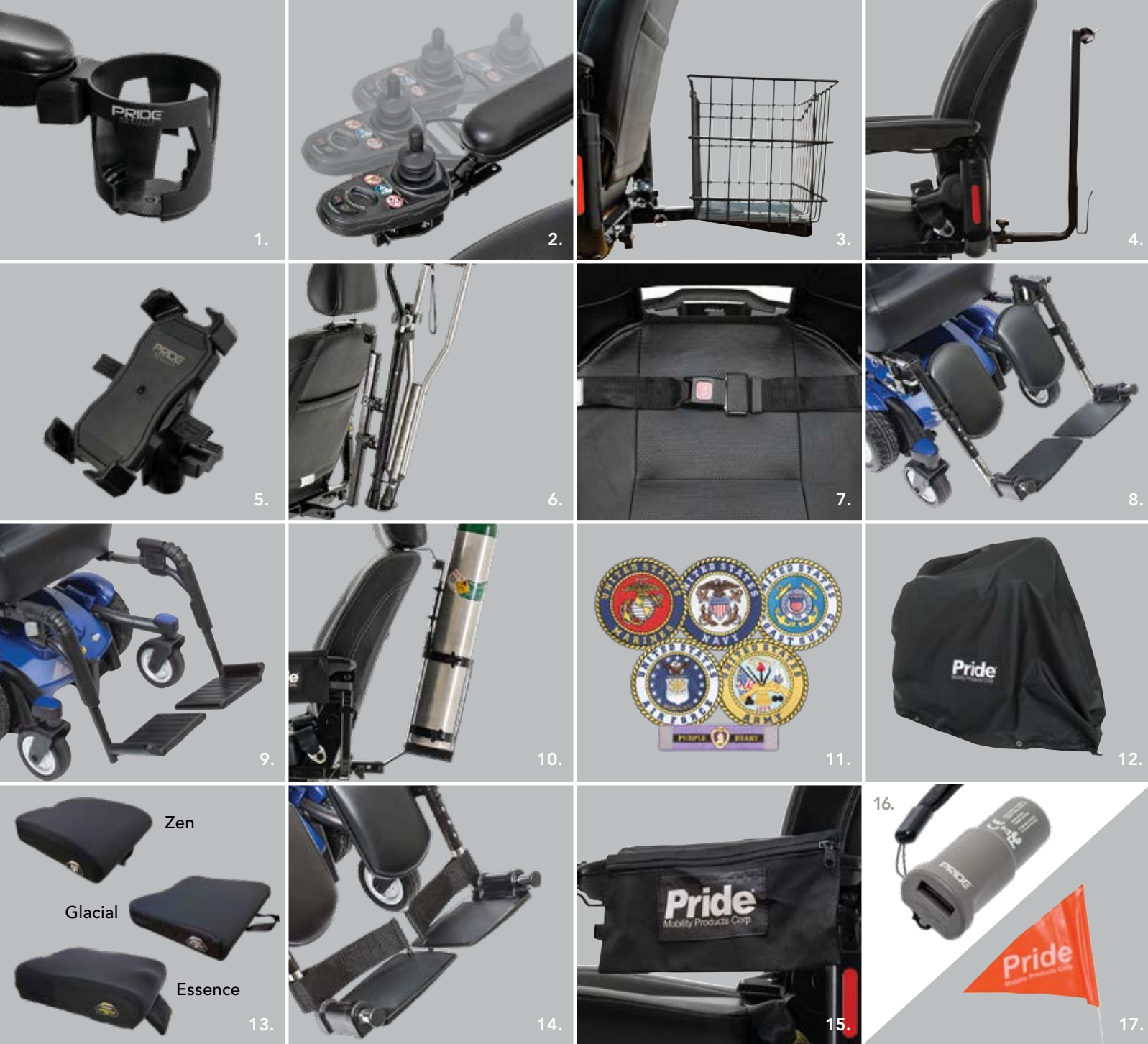
1. New Cup Holder | 2. Swing-Away Joystick | 3. Rear Basket | 4. Walker Holder | 5. New Cell Phone Holder | 6. Cane/Crutch Holder 7. Lap Belt | 8. Elevating Legrests | 9. Swing-Away Legrests | 10. Oxygen Tank Holder | 11. Military Patches | 12. Weather Cover 13. Stealth Products® Cushions | 14. Heel Loops | 15. Saddle Bag | 16. XLR USB Charger | 17. Safety Flag