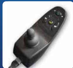
Dynamic Shark Controller