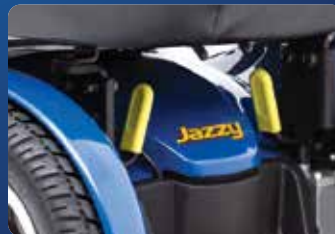
Easy-access free wheel levers

The Jazzy® Elite HD 1 features two-motor, front-wheel drive technology and heavy-duty construction. The Jazzy Elite HD features 14" drive wheels for enhanced outdoor performance combined with a front-wheel drive design to provide tight turns for optimal indoor maneuverability in small spaces. Large front wheels add extra absorption for superb climbing capabilities and combine with front anti-tip wheels for handling various terrains with ease.