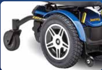
Front-wheel drive design