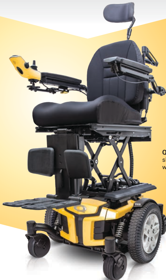
Q6 EDGE® HD shown in Yellow Blaze with iLevel® technology