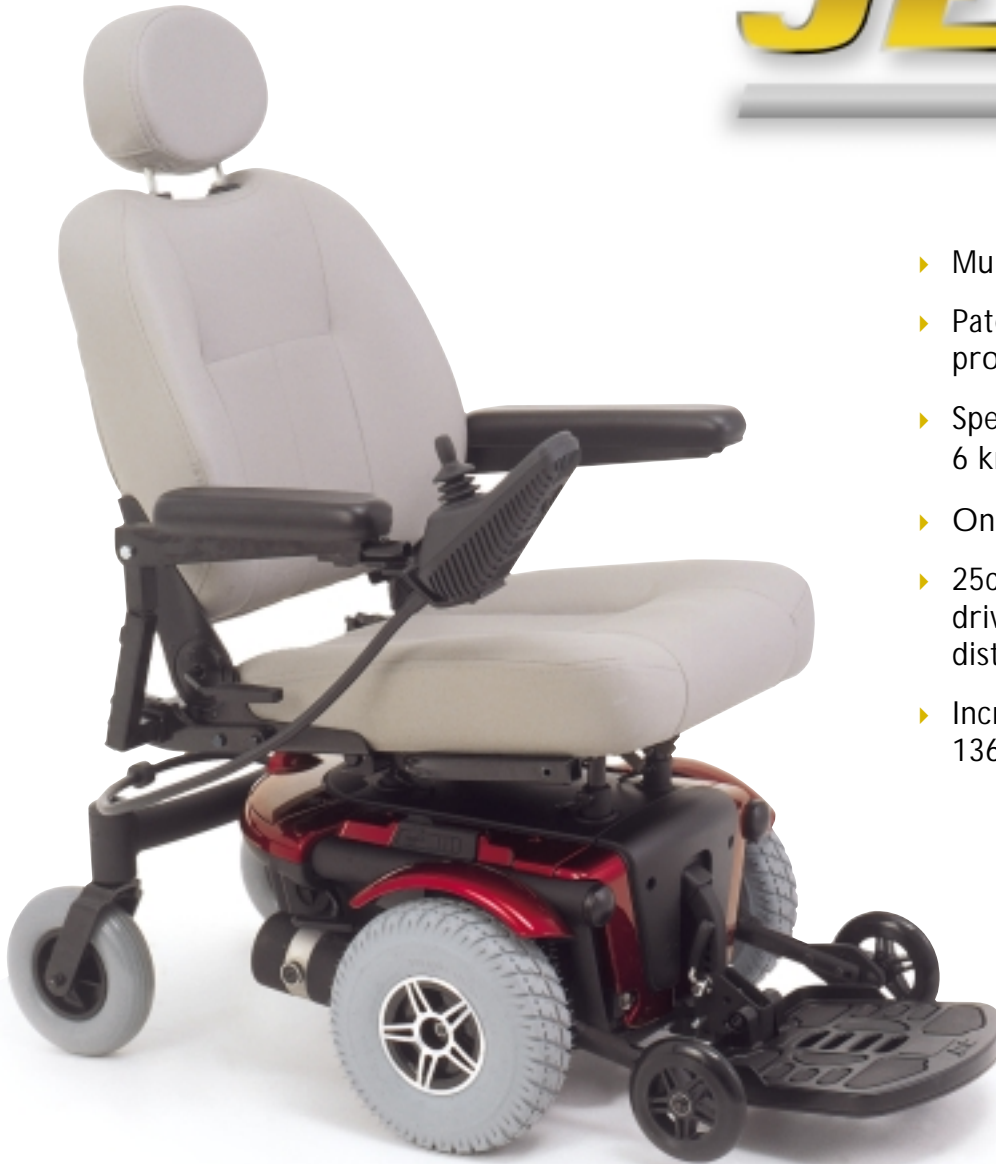
Jet™ 3 Ultra shown in Jet Red with contoured high-back grey vinyl seat with foot platform and PG VSI controller.