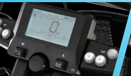
LCD digital display

** Only one rear accessory can be used at a time.