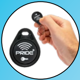
NFC-enabled key fob for enhanced security