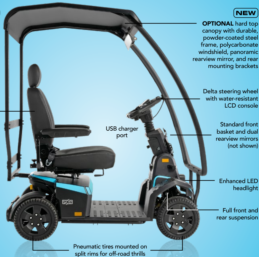
Memory foam seat with 6" slider for adjustable support and premium, all-day comfort