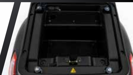
Secure, lockable, under seat storage