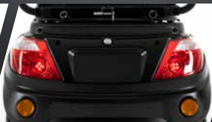
LED brake lights and turn signals