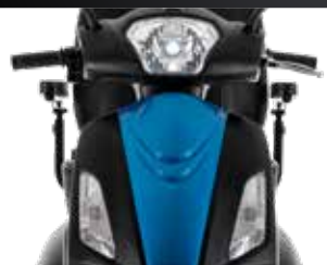
Front LED light package

*Only one rear accessory can be used at a time.