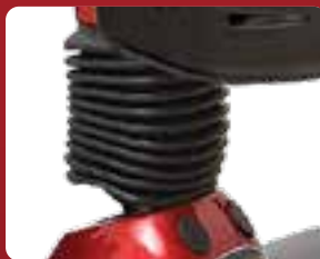
Easily adjustable tiller

The Maxima scooter features an ultra heavy duty drivetrain and a large, deep seat to deliver maximum performance at an exceptional value. Engineered with the bariatric market in mind, the Maxima features a weight capacity of 500 lbs., a max speed up to 5.3 mph, adjustable tiller and an ergonomically enhanced design.