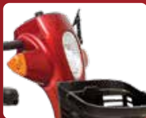
Front headlight on tiller