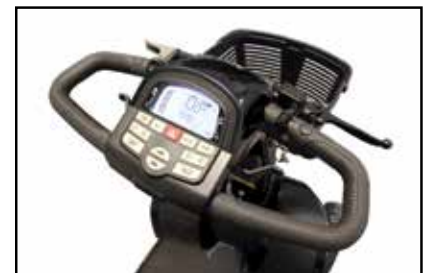
NEW LCD console with speed sensor (standard)