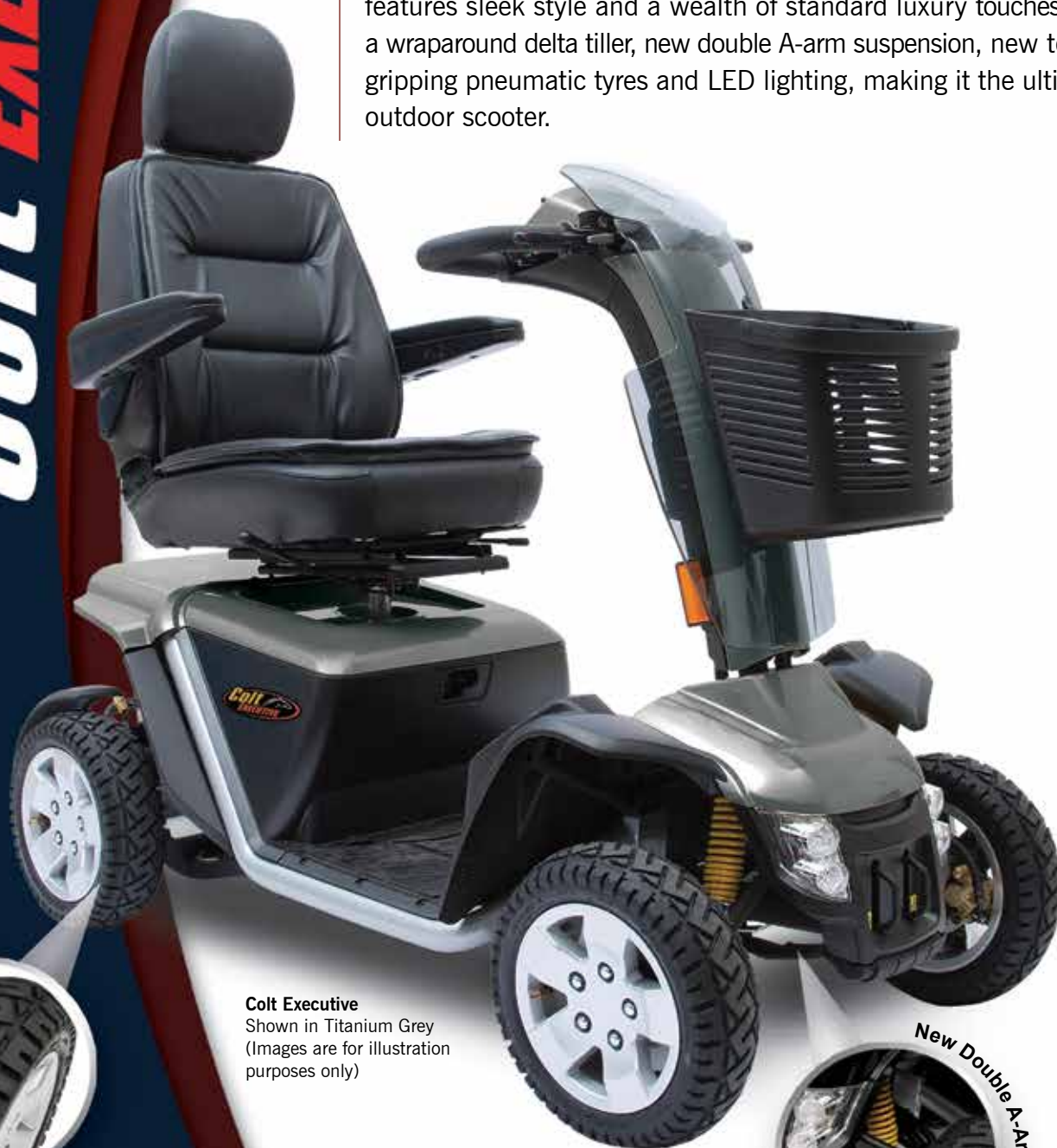
Colt Executive Shown in Titanium Grey (Images are for illustration purposes only)

Bristling with high-performance features like full suspension, low-profile tyres and a hydraulic sealed brake system, the Colt Executive is a blend of power and precision. The Colt Executive features sleek style and a wealth of standard luxury touches like a wraparound delta tiller, new double A-arm suspension, new terrain gripping pneumatic tyres and LED lighting, making it the ultimate outdoor scooter.