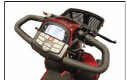
NEW LCD console with speed sensor (standard)