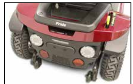
NEW rear LED lights