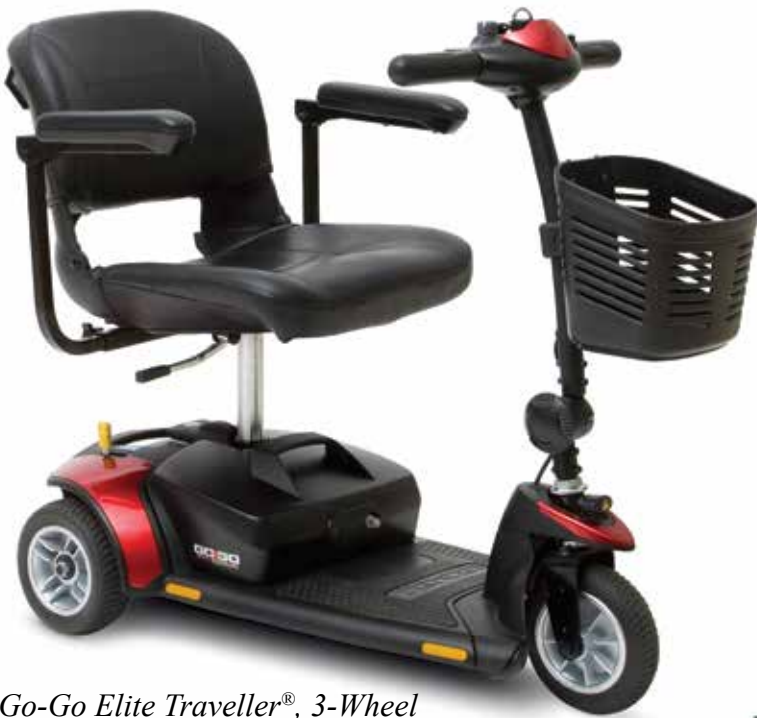
Go-Go Elite Traveller® , 3-Wheel

The compact design of the Go-Go Elite Traveller® allows it to easily manoeuvre in tight spaces while providing stable outdoor performance. The Go-Go Elite Traveller disassembles into 5 pieces, enabling a safe and efficient transition from car boot to on the road. Go where you want to go, easily, with the Go-Go Elite Traveller.