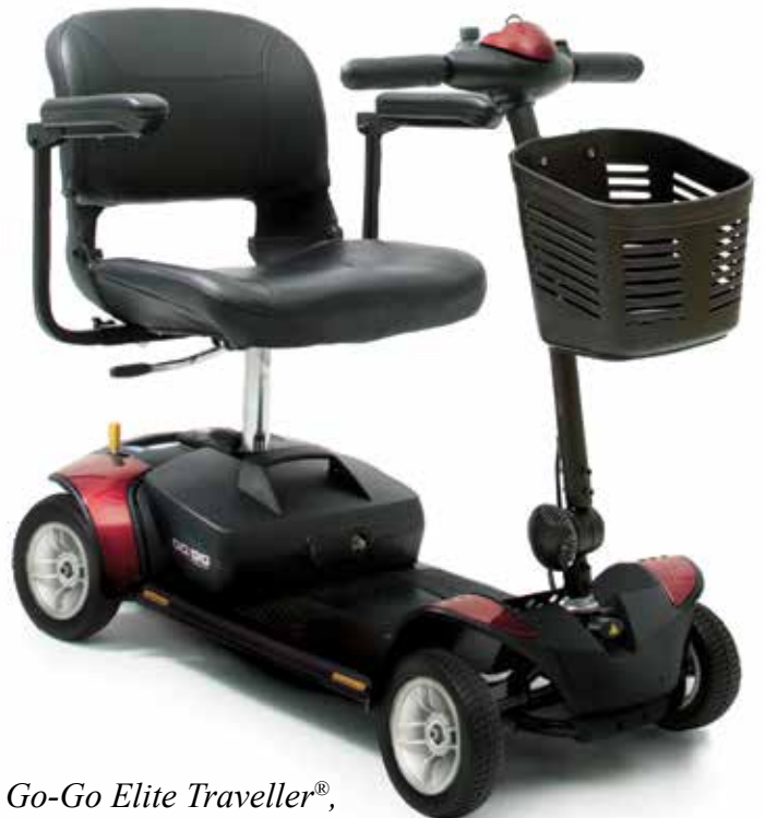
Go-Go Elite Traveller® , 4-Wheel