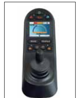
R-Net LCD Colour controller (optional)