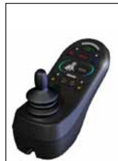
R-Net LED controller (standard)