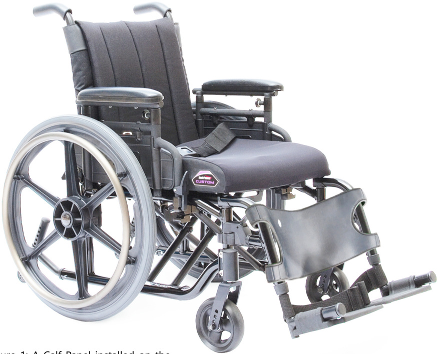
Figure 1: A Calf Panel installed on the leg rests of a wheelchair.